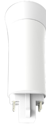
G24Q base Vertical